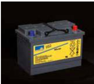
VRLA Battery Maintenance free lead acid battery with a designed lifetime of 7 years.