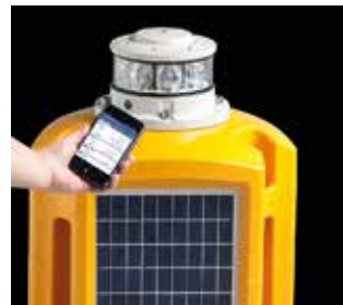
Bluetooth® Control Lantern can be programmed and battery status checked up to 50 meters distance with an app for android 4.4. or above and for iOS.