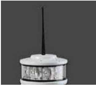
Bird spike Bird spike with thread to be installed in the center of the lantern top.