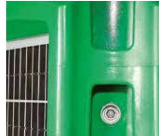
Auxiliary connector Auxiliary connector enables external charging or additional solar modules.