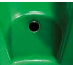
Installation Mounting holes with metal inserts.