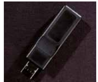
Programming with PC Using Sabik USB interface.