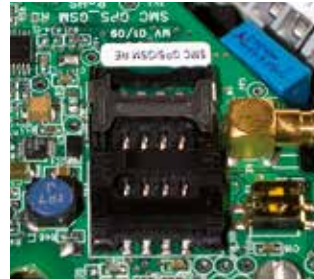
Remote monitoring GSM unit and antenna integrated in the lantern for remote monitoring and control. For more information, please see the LightGuard Section.