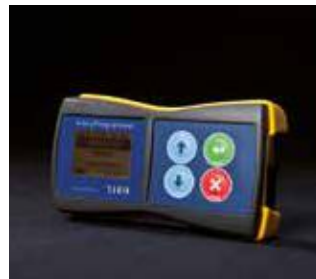
Sabik Easy Programmer User friendly and compact wireless two way programmer.