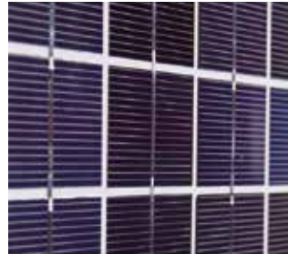
Solar Modules Solar modules with tempered glass front integrated in the PE-housing.