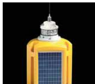
AIS Option Lantern can be equipped with integrated AIS transponder type 1 or type 3